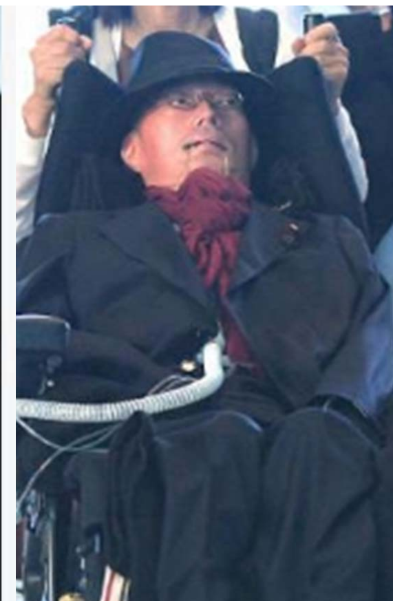
A new MP who uses PA